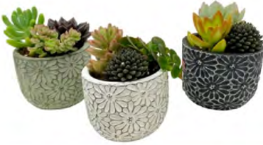
Daisy Pot 2.5" $4.75 each