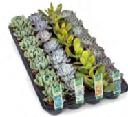
2" Mini Succulents