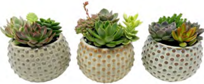
Dotted Stoneware 4.5" - $9.95 each