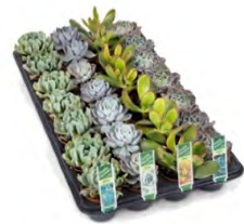
2" Mini Succulents