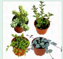
Strings & Trailers