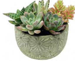
Daisy Bowl 6.5" $14.50 each