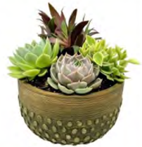
Greenbrier Pot 6.5" $12.00 each