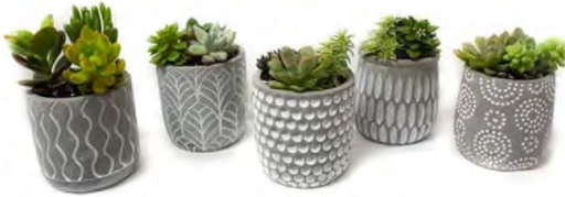
Dovah Pots 3.5" $7.50 each